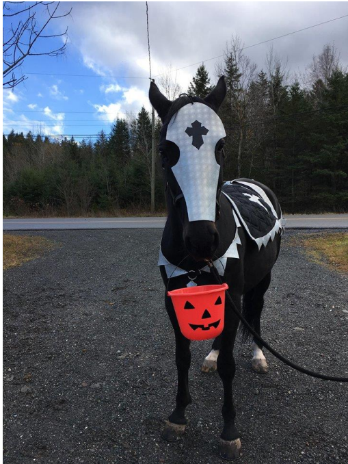
Suzanne's Tuffy ready to go Trick or Treating.....

This rule change will allow the slowest LD riders the entire six hours to complete the course (trail) without having to consider the time it takes for their horses to reach criteria within that six-hour time frame. The "pulse to finish" philosophy to deter racing across a finish line will still apply to LD rides.