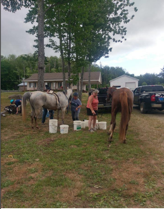
Cooling off at McDonalds Run