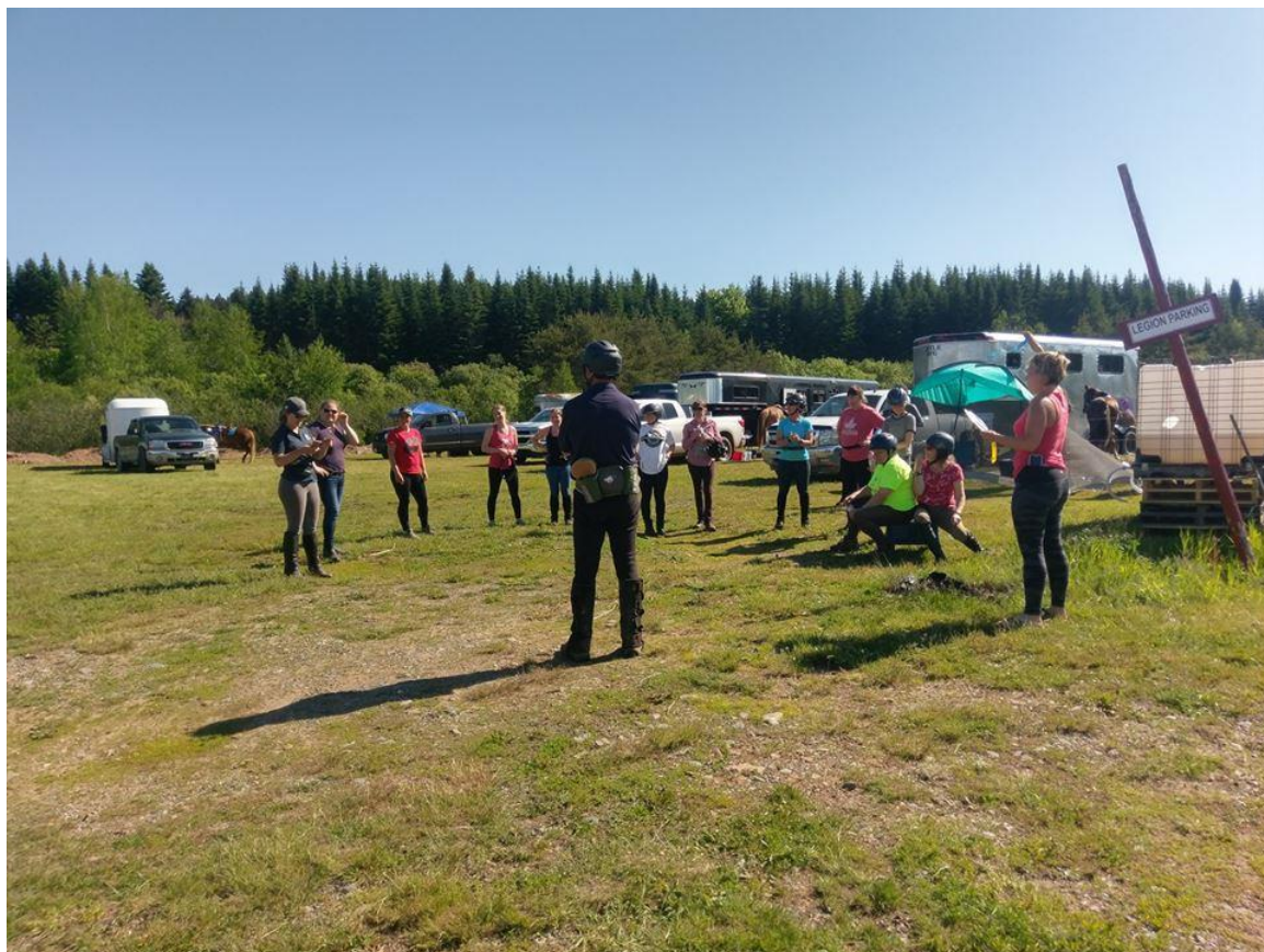
Rider meeting at Red Solo Run

https://www.youtube.com/watch?v=ziP_uCt_OA&feature=related